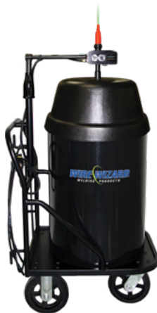
All Environment Drum Cart Package with Feed Assist and Wheels PFA-WT-DC