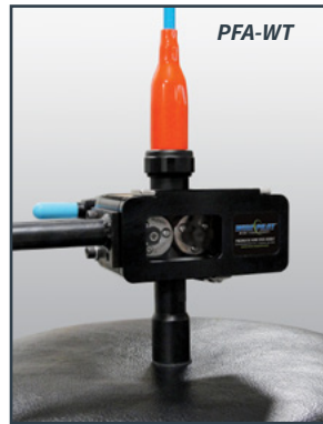
Mounted on drum hood

The Wire Pilot® All Environment Wire Feed Assist has all the features and benefits of the original Wire Feed Assist with a weatherproof, heavy duty housing and fittings. Suitable for outdoor or indoor applications requiring protection from the operating environment. Uses same drive rolls as the standard Feed Assist. Patented design.