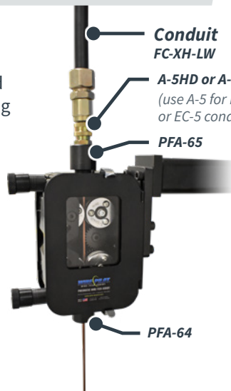
Guide Module® option