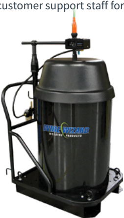
All Environment Drum Cart Package with Fork Lift Pockets PFA-WT-DS