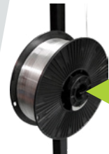
Spool option WGM-PFA- STAND- SPOOL For use with WGM-PFA- STAND.